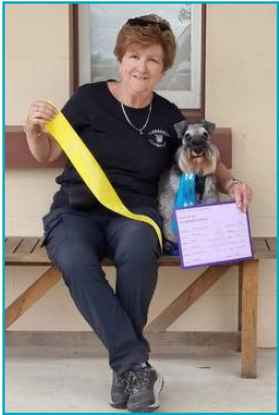
Grafton Scent Trial

Do you think twice about making the effort to bring your reactive dog to training? Are you worn out dodging people and dogs on the grounds by the time class begins? Are you concerned what others think when you're battling to remain composed with your stressed dog? Please know you're not alone. I, for one, have definitely been there!