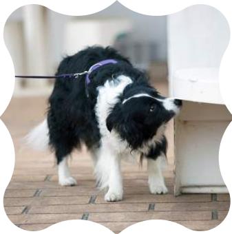
Piper doing advanced exteriors at Western Sydney Scentwork Club.