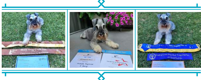
Left to Right: Scentwork Advanced, K9 and Hills Graduate, the Rally Novice Title Trials

I encourage anyone who is having difficulties with their puppy or dog, to keep persisting and be your dog's advocate. If you have doubts or feel as though you're not getting anywhere, no matter what triggers your dog's reactions, keep calm, stay positive, consistently work on building that relationship and ask an instructor for help if needed. Over time, skills eventually become automatic, your bond with your dog deepens and you will become the focus of your dog's attention as their trusted leader.